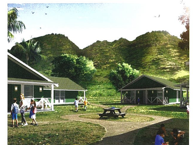
Rendering of Camp Erdman renovated cabins.