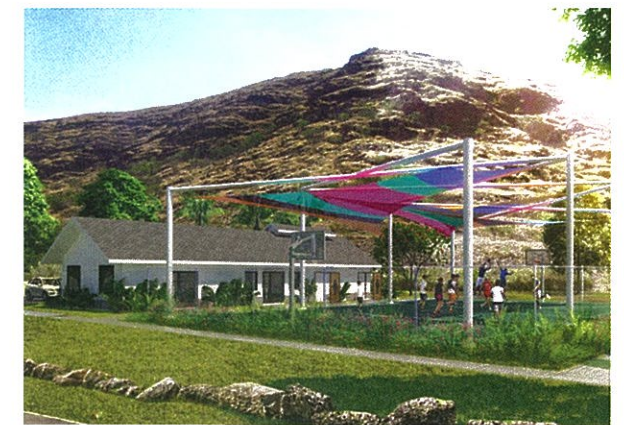
Rendering of the YMCA Wai’anae Program Center.