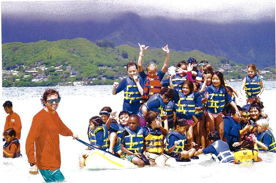
At Kama'aina Kids' camp, children learn how to paddle and sail.

permits allow your stay to begin on Friday and end on either Monday at 8am (three days for $32) or Wednesday at 8am (five days for $52). Family campsites accommodate up to 10 persons max.