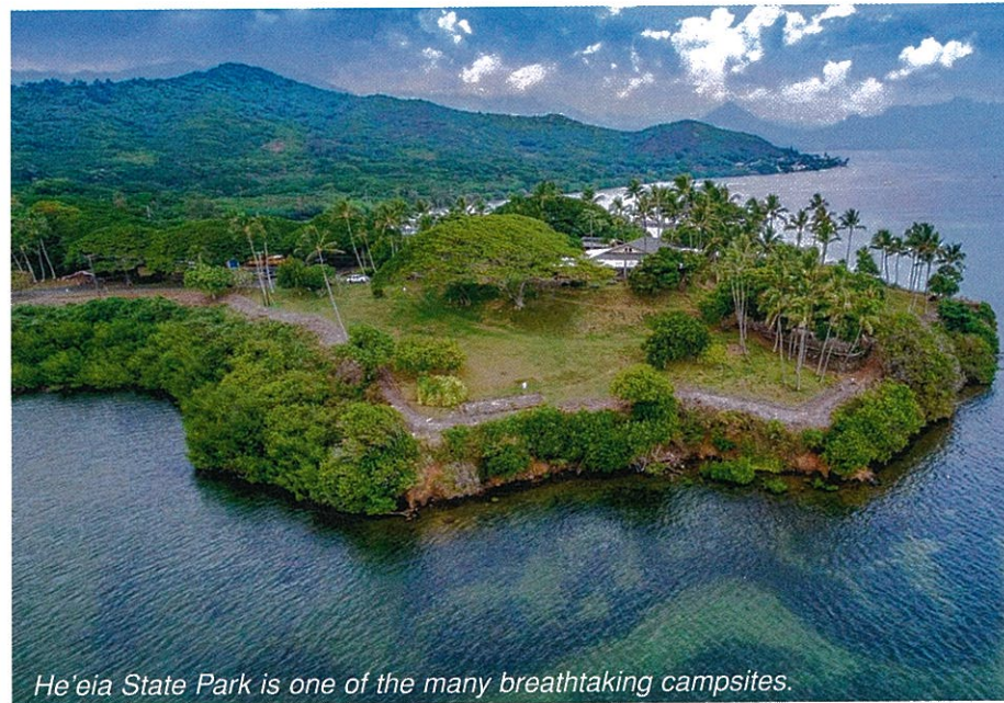
He'eia State Park is one of the many breathtaking campsites.

Since these parks serve a diverse and densely populated urban community, you'll find that rules and procedures differ from those on the Neighbor Islands. Camping is prohibited on Wednesday and Thursday nights, while Sand Island limits